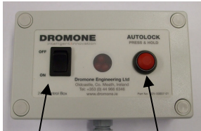
Stage 1 Stage 2 (2 Stage control protects against accidental release)